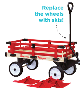
THE WAGON Convertible Wagon $130; kotulas.com