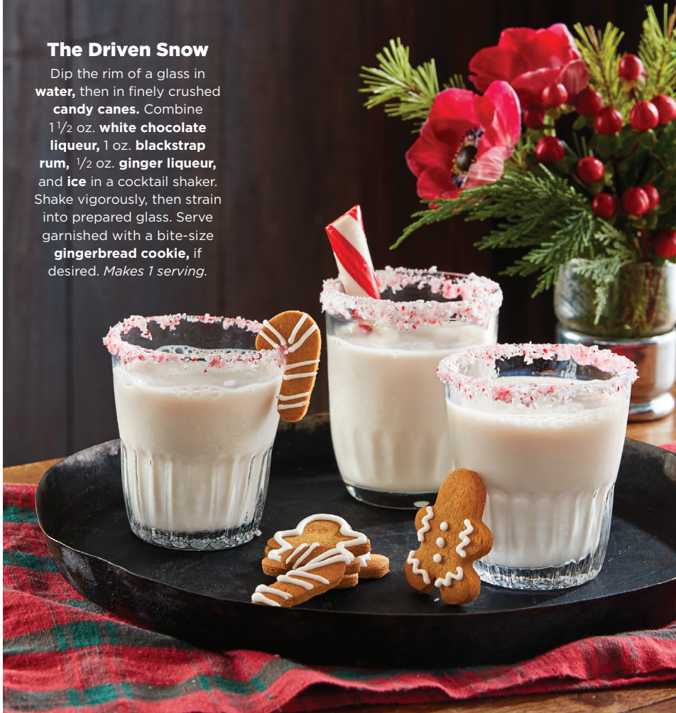
STYLING BY TORIE COX; ILLUSTRATIONS, MELINDA JOSIE.

Dip the rim of a glass in water, then in finely crushed candy canes. Combine 1½ oz. white chocolate liqueur, 1 oz. blackstrap rum, ½ oz. ginger liqueur, and ice in a cocktail shaker. Shake vigorously, then strain into prepared glass. Serve garnished with a bite-size gingerbread cookie, if desired. Makes 1 serving.