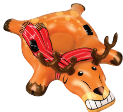
THE INFLATABLE Durable Vinyl Reindeer $49; amazon.com

At Paws Up, you can hitch a holiday haul with a wrangler and Percheron draft horses Pete and Repeat (page 42). At home, swap your seen-better-days saucer with one of these joyrides.