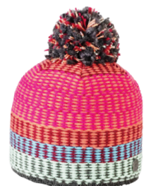
Multicolor $44; pistildesigns.com