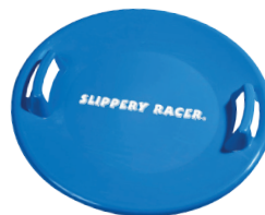
THE SAUCER Saucer Snow Sled $24; walmart.com