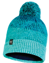
Monochrome $30; buffusa.com