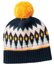
Fair Isle $39; bodenusa.com

Pom-poms can be traced to Vikings and, later, military uniforms. (Some say they helped seamen avoid hitting their heads!)