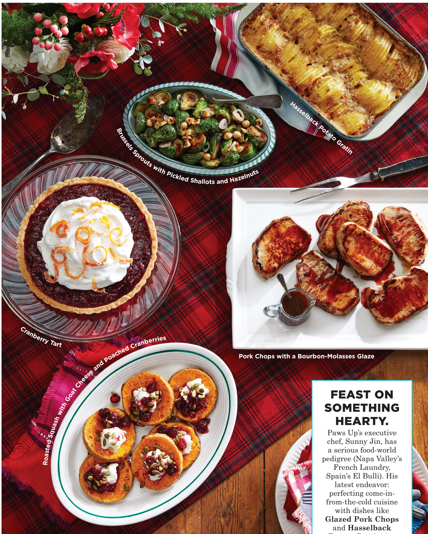
Brussels Sprouts with Pickled Shallots and Hazelnuts