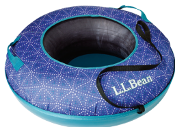
THE TUBE “Sonic” Snow Tube from $129; llbean.com