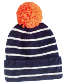
Kids' Stripe $30; jcrew.com