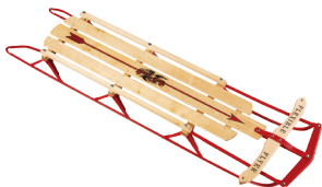
THE SLED Steel Runner Sled $100; amazon.com